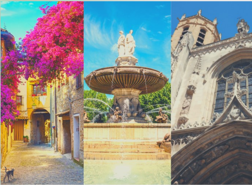
Discover Aix en Provence

A replica of the Parisian chic of the left bank in the depths of Provence, Aix) is very classy: its green boulevards and public squares are lined with 17th and 18th century mansions, punctuated by gurgling fountains covered with moss. Haughty stone lions guard its largest avenue, the Cours Mirabeau bordered by cafes, where fashionable Aixois pose on polished paved terraces, sipping espresso.