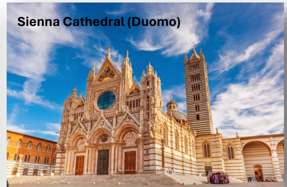
Sienna Cathedral (Duomo)

Optional guided tour with a professional guide with entrance to Siena Cathedral