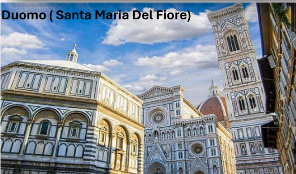
Duomo ( Santa Maria Del Fiore)

The historic centre of Florence is an open-air museum, with probably the greatest concentration of artistic masterpieces in the world!